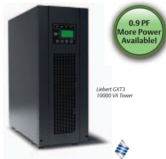
Liebert GXT3 10000 VA Tower